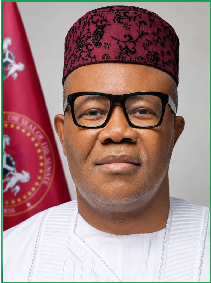
HIS EXCELLENCY GODSWILL OBOT AKPABIO CON PRESIDENT OF THE SENATE, CHAIRMAN NATIONAL ASSEMBLY FEDERAL REPUBLIC OF NIGERIA